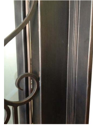
5/8" wrought iron