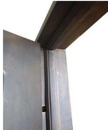
6" width jamb

10) All doors are hot dip galvanized, sand blasted, spraying zinc, oven baked oxide primer, black paint and handy faux finish, varnish coated for the best possible anti-rusting.