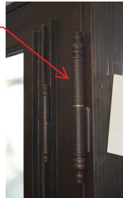
Heavy Duty Hinges